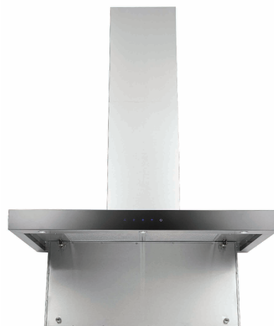
Hinged filter access panel to mesh filters