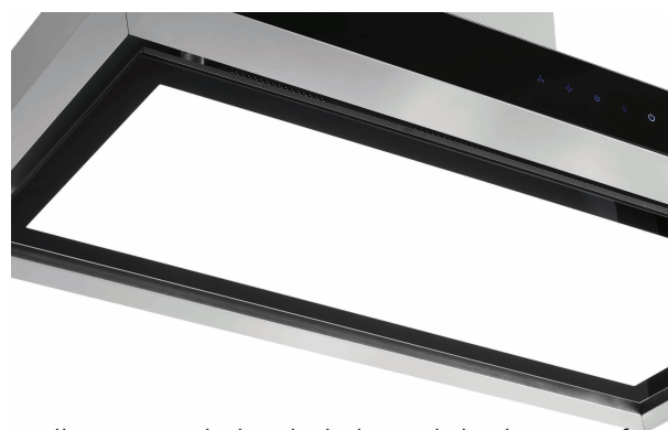
Full LED panel - bright light and shadow proof